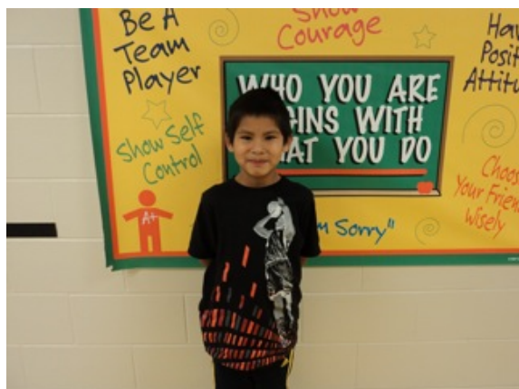
Kindergarten November Birthday